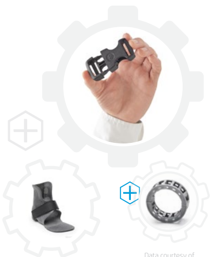
Data courtesy of OT4 Orthopädietechnik GmbH